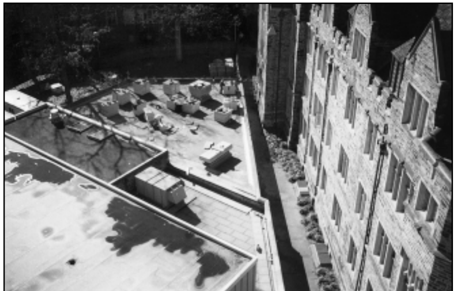
Installing LIGHTGUARD® on one of the many T. Clear Protected Membrane Roof Systems at Duke University.

As Pennigar puts it, "Our main hospital is a 150,000 square feet gravel-ballasted PMR (protected membrane roofing system) with four-ply BUR on a concrete deck with 2 or 3 inch Dow blue board that was built back in the 70s. I was asked to evaluate this roof to look at the possibility of putting a heliport on top of the hospital. I thought this would be a great opportunity